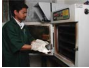
High Temperature Oven