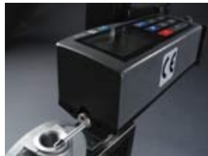
Final Testing of assembly