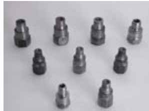
Precision Engineering Components