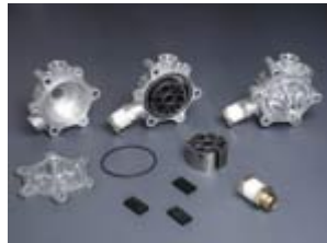
VP Pump Assemblies]