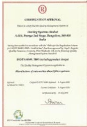
ISO/TS 16949-2002 Certification