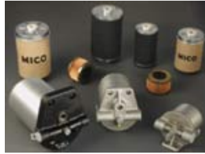
Single Filtration Systems