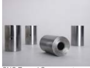
CNC Turned Components