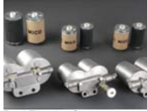
Dual Filtration Systems